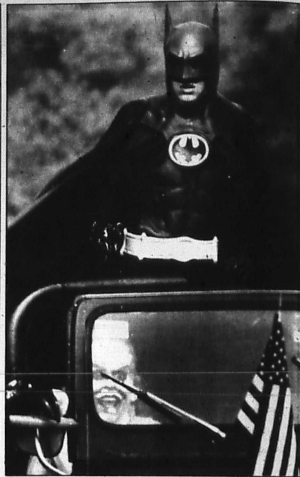
Batman and his nemesis, the Joker, ride in the parade.