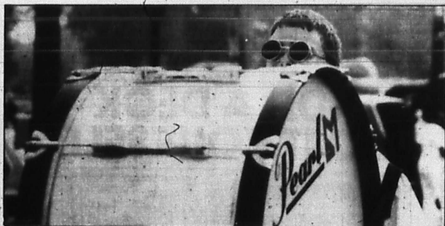
Beating the drum is a barely visible member of the Conqueror II Drum & Bugle Corps from Ontario.